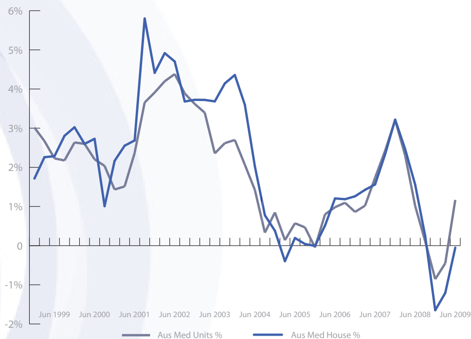
Australian Median Growth Rates Houses vs Units